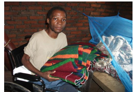
A Day Care patient with a blanket to take home

The new Day Care Service is proving to be a major success. On the last Tuesday of every month, bed bound patients are being driven to the Centre in the Ndi Moyo ambulance to give them a day away from home and their carers some respite. Patients are given a cooked meal, a nursing review and can receive complementary therapies like head and food massage. If needed they are given a blanket to take home – something much appreciated by patients who may have nothing to keep them warm during the winter season.